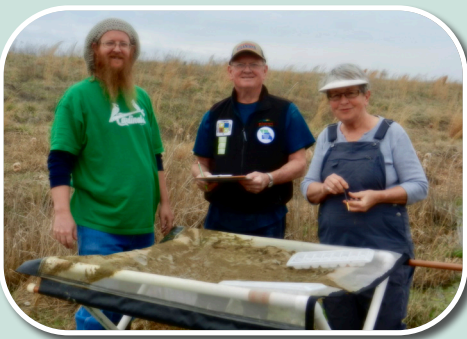
Streams Team 5692 look for macroinvertebrates in Spring River in Jasper County.