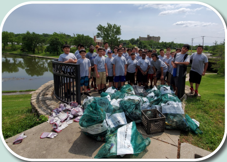
Stream Team 5390 proudly display their haul from Brush Creek in Jackson County.