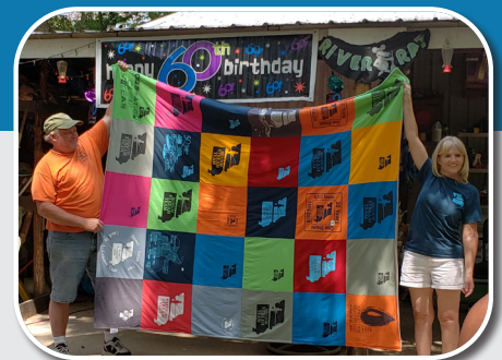
Team 387 honor their team leader with a quilt made of t-shirts from over the years.

**Includes projects like website development, newsletters, scout programs, fundraising, etc.