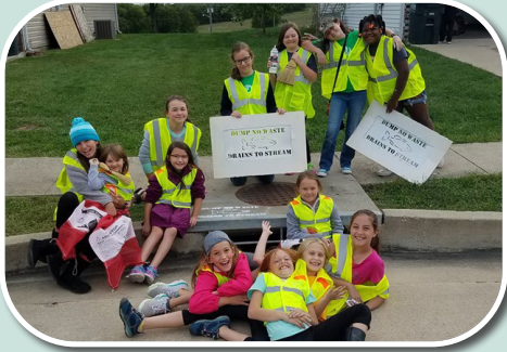
Girl Scouts with Stream Team 5254 stenciled the storm drains in a local neighborhood in Fulton.

promoting citizen awareness and involvement in river and stream conservation