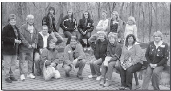
The Southwest Ozarks Stream Team Association (Team 4139) recently held another successful meeting. The Joplin Globe published an article about their accomplishments and plans.