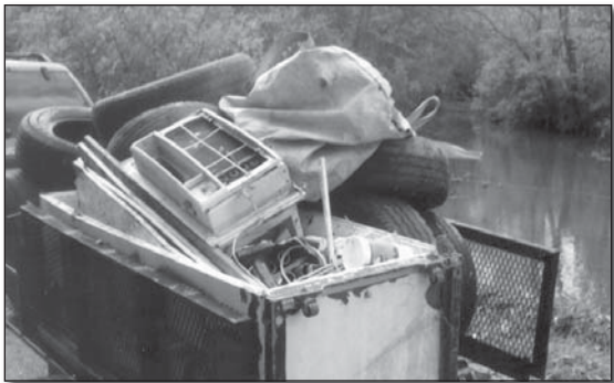
Trent Avuil of Stream Team 4072 reported collecting 17 tires, a refrigerator, an air conditioner, and other assorted trash. Whew!