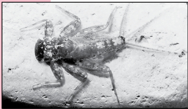
Although mayflies are generally considered sensitive organisms, some species are more tolerant and can handle lower oxygen environments.

Mayflies have an incomplete life cycle, or are hemimetabolous. When the eggs hatch, the nymphs molt 12 to 45 times depending on the species and the temperature of the water, completing development in as short as two weeks or as long as two years. The final wingless nymphal stage molts to a winged form called a subimago or dun. This form is still sexually immature in most species. These forms are generally dull in color and have opaque wings. This life stage makes mayflies unique. All other insects