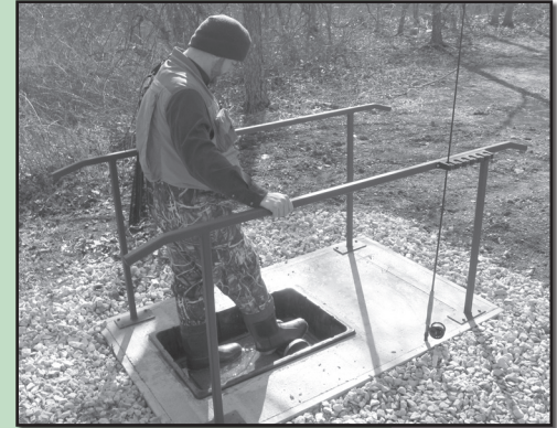
The Missouri Department of Conservation has created boot wash stations with a 5% salt solution at Trout Parks throughout the state to help prevent the spread of didymo.