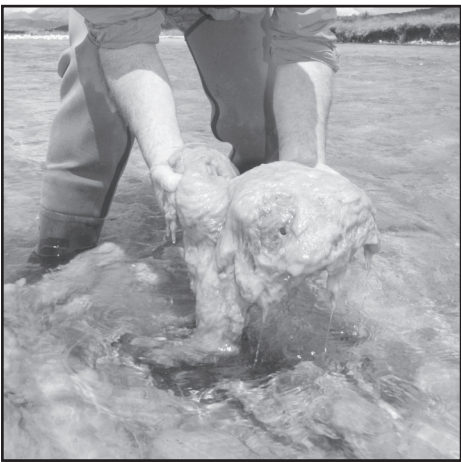
Didymo smothers the bottom of a stream, making it difficult for fish to feed and making fishing an impossible activity.

Once didymo is established in an area, wading is hazardous due to slick, algae-covered rocks. The spread of didymo can also affect recreation by clogging water intakes of boat motors and interfering with fishing gear and lines. Excessive blooms of didymo can render fishing impossible, with devastating economic consequences.