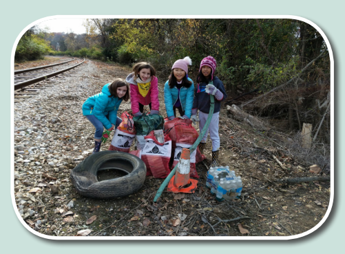
These girls from Stream Team 5671 proudly display their haul from North Buder Park in St. Louis County.