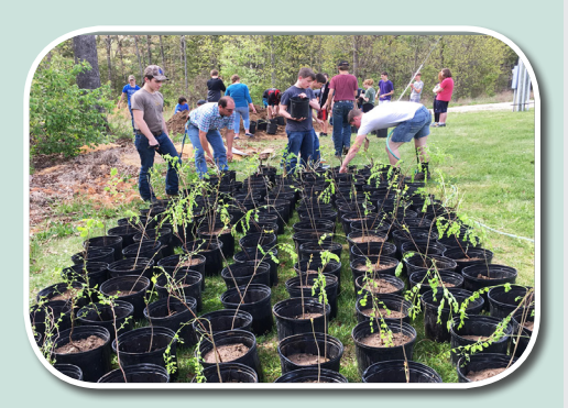
Stream Team 5158 prepares for a tree planting along Yadkin Creek in Crawford County.