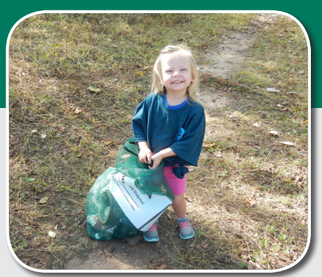
A young member of Stream Team 5617 collects trash from Pomme de Terre lake in Hickory County.