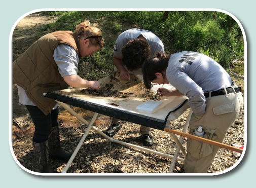
Stream Team 4794 monitors macroinvertebrates on Little Bonne Femme in Boone County.